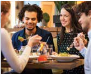
The Craft Center will be located directly above the neighborhood's main dining hall.