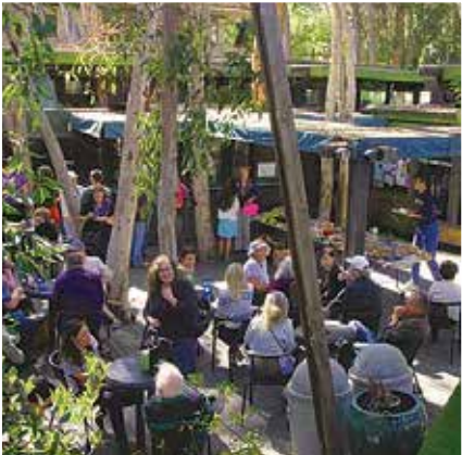
Located in the heart of the old Student Center, the original Craft Center was a community hub for creative expression.

events, footsteps away from dining and entertainment. Direct access to parking and the nearby trolley stop connect this space to our community, and our neighbors, to an unprecedented degree. It'll bring back what we had before, and make possible the inclusion of so many others.