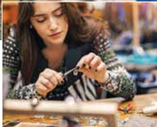
Students will learn how to plan and execute their own jewelry designs.

The new reenvisioned Craft Center will commingle student and community members in a collaborative, open place for experimentation, imagination, and craftsmanship.