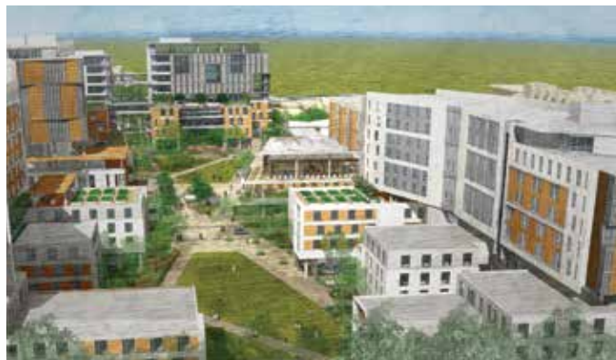
The neighborhood's new Craft Center and mixed-use community building will be a centrally located and highly visible heart and hub for expression, creation, and passion.

With a gift to the Campaign for UC San Diego, you make the Craft Center a renewed possibility, enhancing experience in the North Torrey Pines Living and Learning Neighborhood. You will help our students, staff, faculty, and friends pursue new interests and build lasting bonds. The North Torrey Pines Craft Center perfectly represents a signal Campaign goal of enriching our campus community. With your support, you assure our collective success.