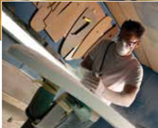
Local expert board-builders will guide classes in surfboard shaping, from blank to glassing.