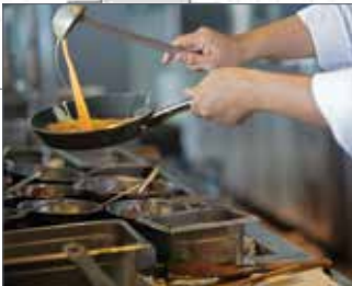
Specialized cooking classes will be offered, ranging from the basics to more advanced techniques.