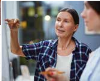
Art educators will teach classes for all ages and skill levels across a spectrum of media.