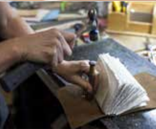
Book arts classes will give participants the chance to bring words to life.

The reimagined Craft Center is designed for year-over-year financial sustainability, with a nimble business model that makes the most of cross-campus efficiencies.