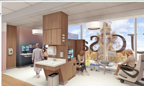
The completely rebuilt medical campus in Hillcrest will transform our ability to provide care for Central San Diego and beyond. This includes more than doubling our capacity for infusion services (concept rendering above).

As part of the only academic health system in San Diego, UC San Diego Medical Center – Hillcrest is home to transformative innovation in medical care. Now, after more than half a century of serving San Diego, it is time to envision what the next half century and beyond can have in store. By transforming our campus in Hillcrest, we can bring new and expanded services to the region while redefining health care around the world through research and training programs.