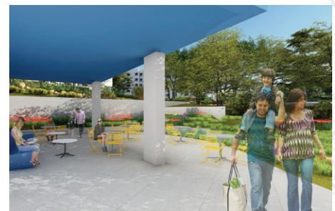
The outdoor dining area opens onto the healing garden, a space to engage the senses and offer respite.