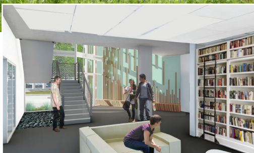
The first-floor lobby and lounge offer a supportive gathering place for residents.

Since 2000, UC San Diego Health has expanded its footprint to include a variety of new specialty facilities and increased our capacity to serve patients from San Diego and beyond. The La Jolla Family House plays an integral role in extending our reach to provide whole-person care to our visiting patients and supporting their loved ones.