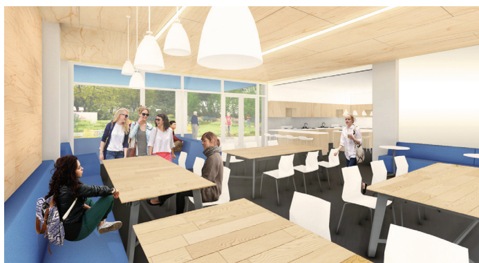
The dining room and kitchen are the heart of the La Jolla Family House.