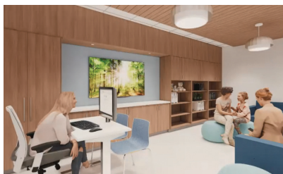
Cancer Resource Center for patients and families (concept rendering above).

Our goal is to create a health care ecosystem which supports multidisciplinary collaboration between physician-scientists to address the individual needs of each patient. Because the Outpatient Pavilion will house many specialized clinics in one building, not only will physicians have direct access to their peers, but patients and their families will have an easier experience navigating their health care needs since their providers, treatments and services will be all in one place.