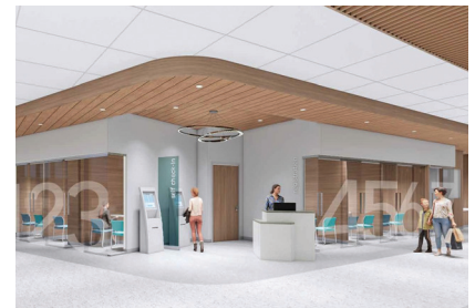
The new central registration area will welcome patients and families with an easy to navigate check-in process.

UC San Diego Health is the one place that can integrate research, teaching and clinical care across its health care offerings. The new Hillcrest Outpatient Pavilion will be a central component of a top-rated academic health campus and an invaluable resource for all San Diegans.